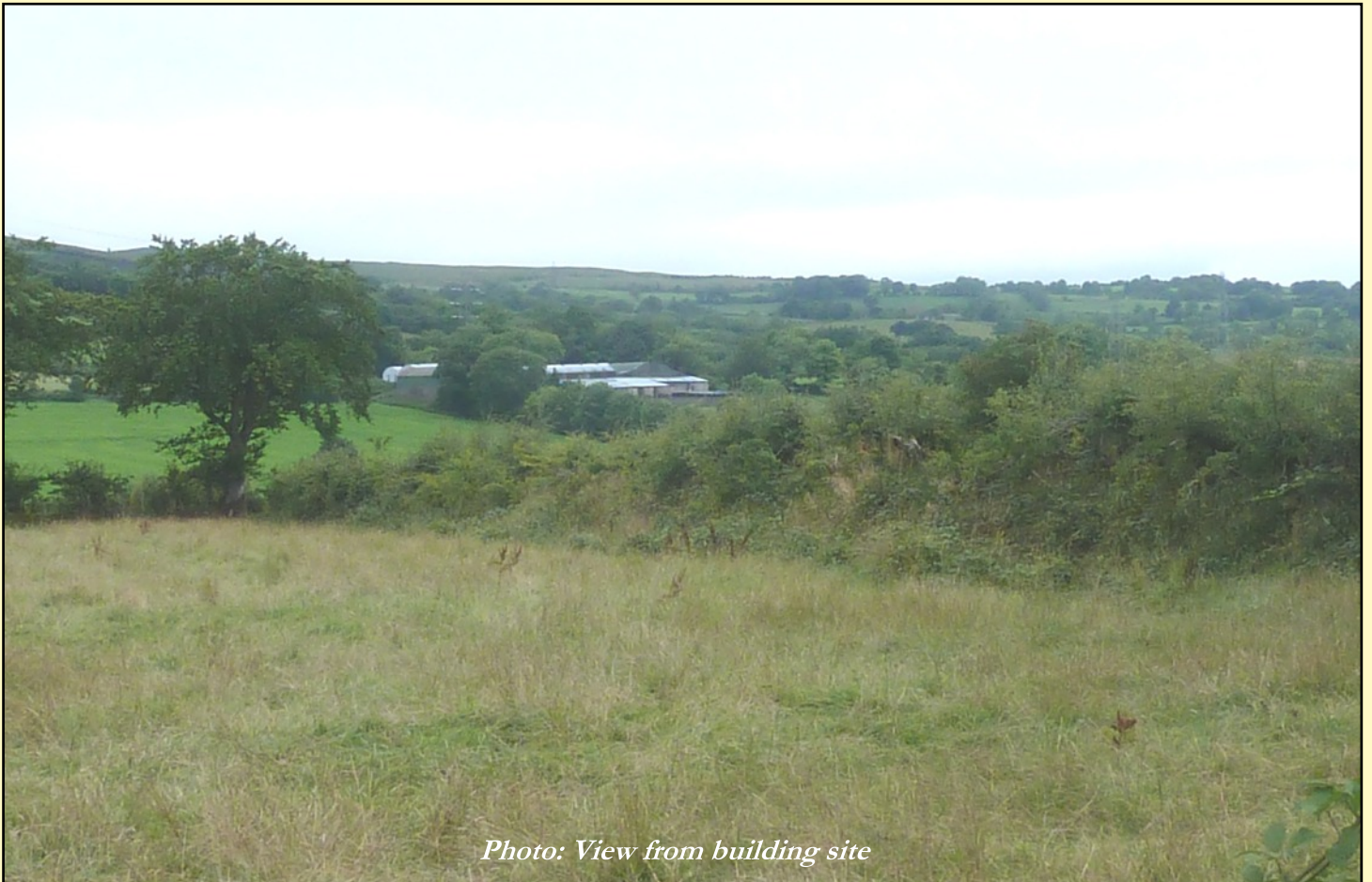
Photo: View from building site